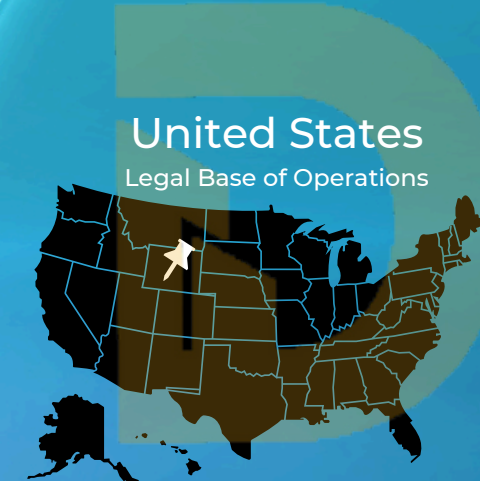
United States Legal Base of Operations