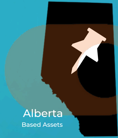
Alberta Based Assets