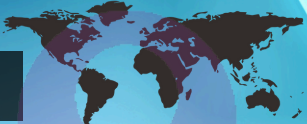
International Business Development & Expansion