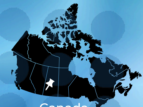
Canada Business Development Agency