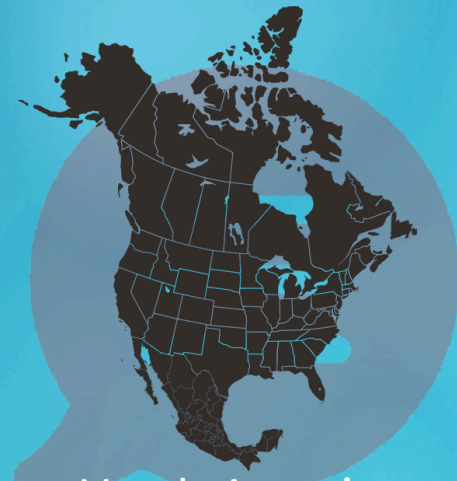
North America Marketing & Connectivity